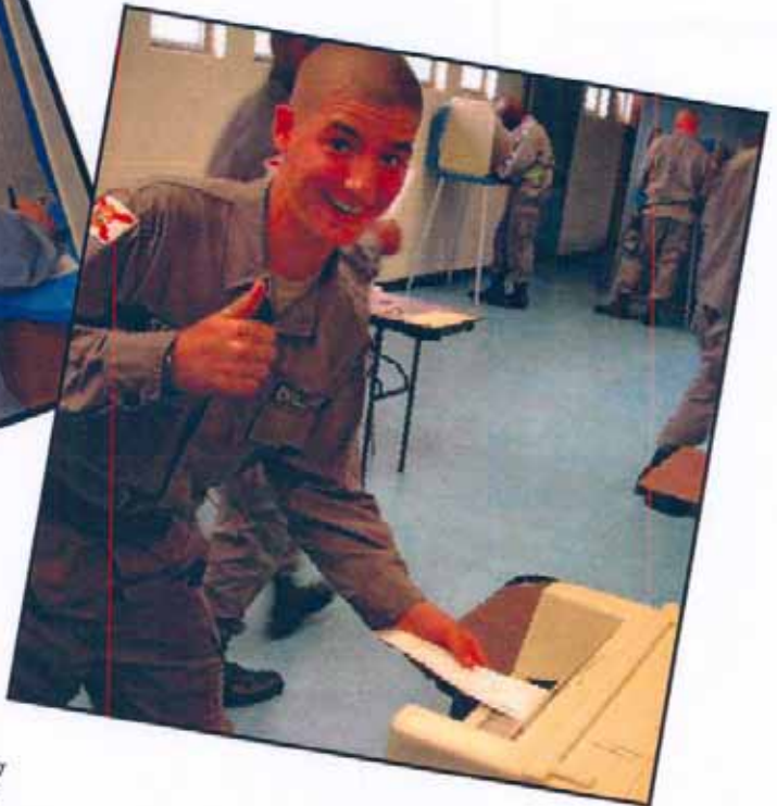
Florida Youth Challenge Academy cadets mark their ballots.