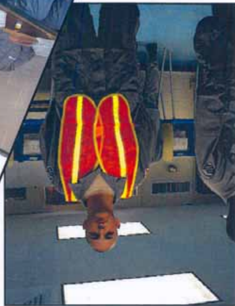
FYAC Cadets attend class and fill out voter registration forms.