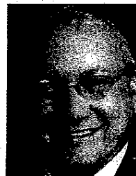
REPRESENTATIVE RUSSELL PEARCE ARIZONA

"It's the states' responsibility. But states need to recognize the threat to national security of an unsecured driver's license. We have an inherent